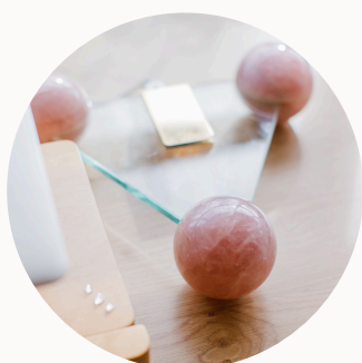
Scanning your Bio-Field

Quantec then generates a support healing sheet, containing all the relevant frequencies needed for you and your intention to help correct the existing imbalances. These energy frequencies will be directed to you, for the required amount of time to initiate the rebalancing process.