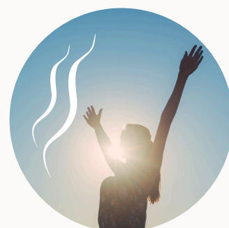
Receiving Quantec Support Balancing Frequency