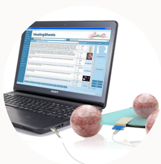
Creating your Quantec Support Balancing sheet